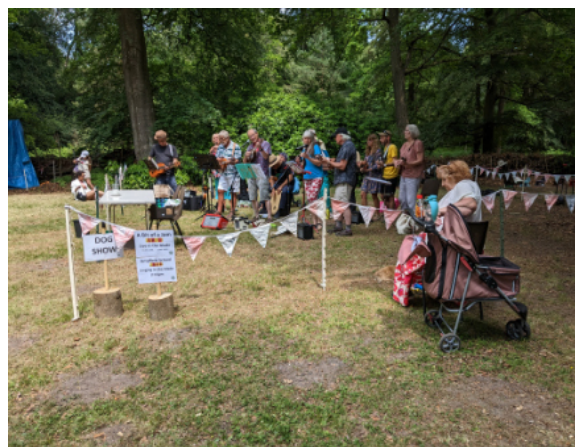
Annual dog show, St Mark