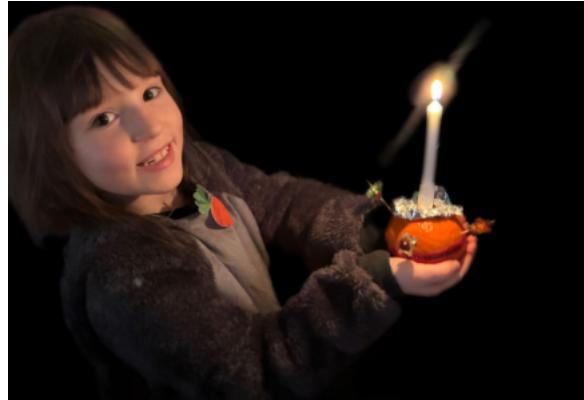
Christingle service, St Mark

While in vacancy we are praying that the right person will feel called to support our growth as a single parish.