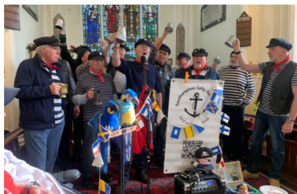
Recital from the Salty Seadogs