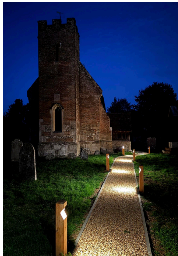
St. John's new, accessible path