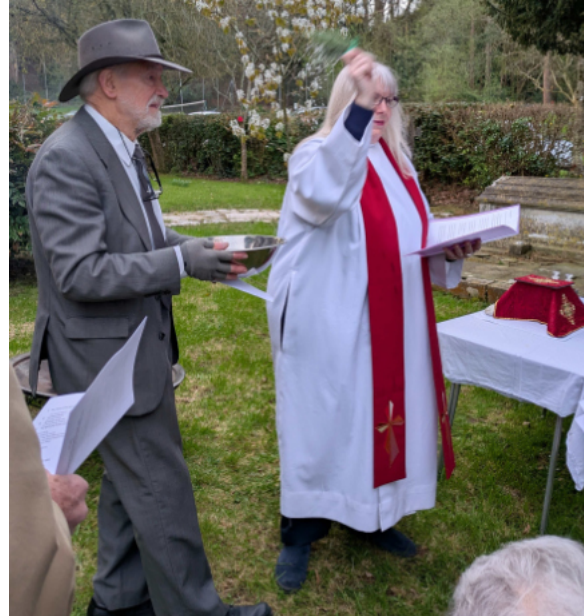
Dawn service, Easter at St. Denys

running the previous parishes who have helped so much with the transition.