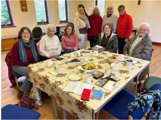
Pilgrim discussion group at St. Mark's