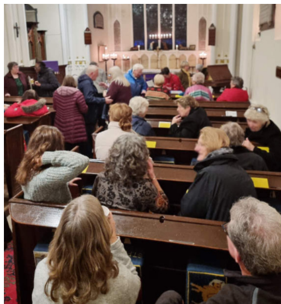
Carol service, St Denys