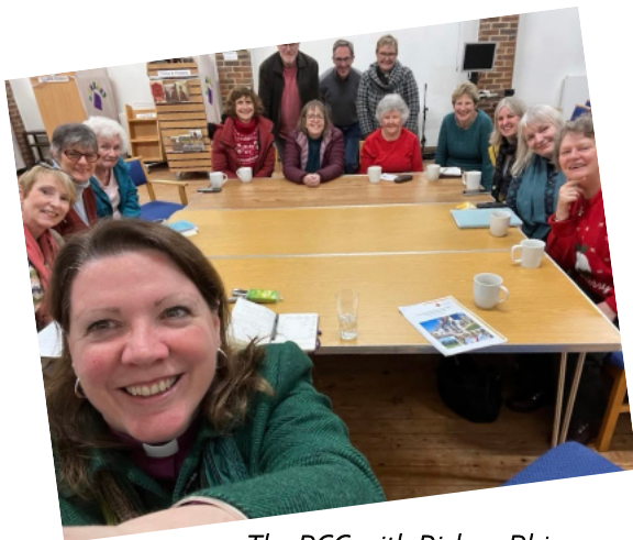
The PCC with Bishop Rhiannon