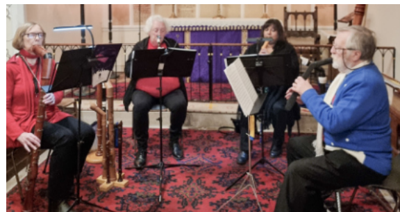
Consorte D'amici playing at St Denys

We also hosted a talk at All Saints about the Atlantic salmon and its changing environment. Although something of a niche topic, it was well supported and brought people into our church who had never visited before.